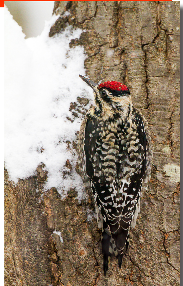
Photos: Above, and lower left, female Yellow-bellied Sapsuckers

Yellow-bellied Sapsuckers drum during the breeding season to defend a territory and to attract a mate. Females also drum. The drumming of this species is characteristic and easily identified. The bird taps on a wooden substrate, such as a branch or loose bark, with an irregular, doublet pattern that can be heard from a significant distance ( http://macaulaylibrary.org/audio/87149 ). Breeding starts in April, with males drumming to set up their territories. Females arrive about a week later and seek out nesting sites. Apparently, this species will nest in the same tree, often the same nesting cavity used during the prior year. Males will do most of the nest cavity excavation. Females lay their 4-5 eggs directly on the exposed wood at the bottom of the cavity. Females will incubate the eggs for a little under two weeks. The nestlings are fed by both parents and fledge at around 27 days after hatching. Young are fed for only a few days post-fledging, after which they start to feed themselves on insects.