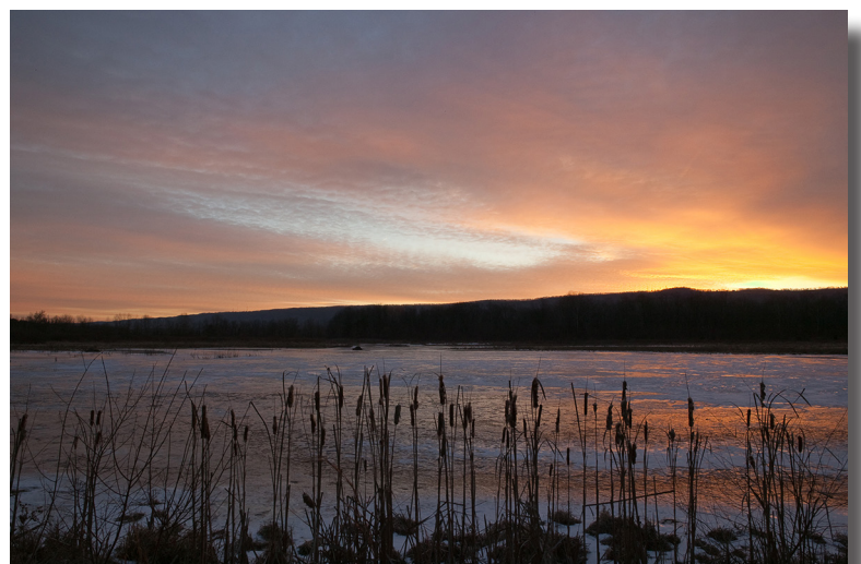
Stauffer's Marsh