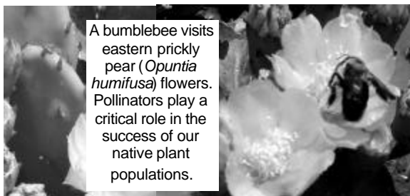
A bumblebee visits eastern prickly pear ( Opuntia humifusa ) flowers. Pollinators play a critical role in the success of our native plant populations.